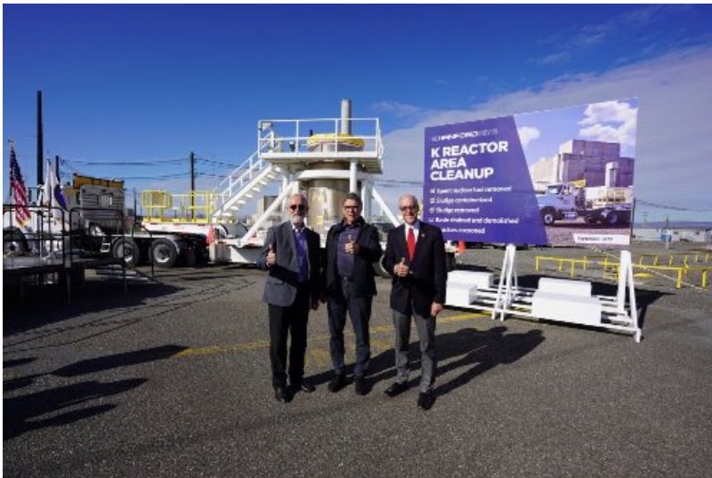
Walden gives a thumbs-up along with Secretary Perry and Rep. Newhouse.

I kicked off the month of October with a trip to the Hanford Site with Secretary of Energy Rick Perry and Congressman Dan Newhouse. The millions of gallons of Cold War-era nuclear waste in close proximity to the Columbia River has long been a potential hazard.