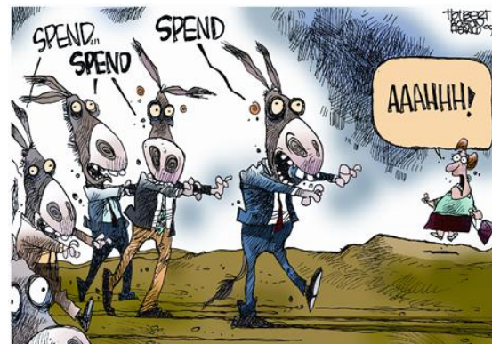
NIGHT OF THE LIVING DEBT