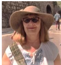
Visiting St Paul du Vance, France