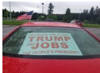
Open Oregon Rally May 2020