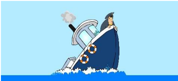
USS Biden 2020