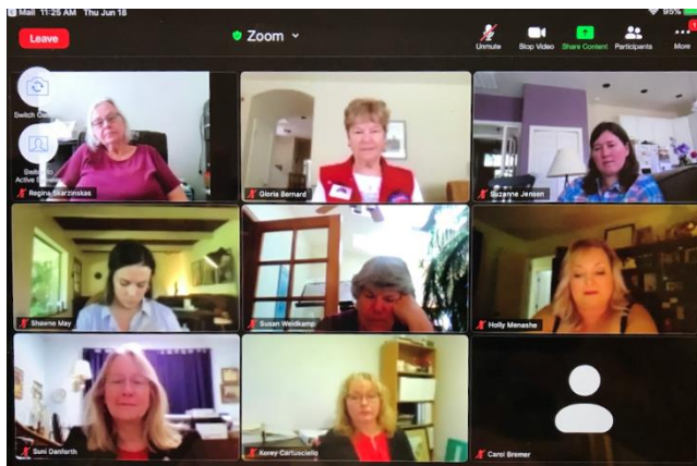
Screen shot June 18, 2020