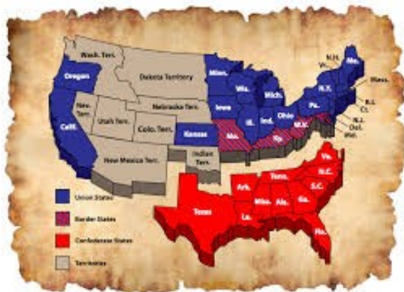
Slave and Confederate States at the time of the Civil War.

The Emancipation Proclamation applied only to the 11 states that had seceded from the United States, leaving slavery untouched in the four slave states (AKA Border States) that remained loyal to the United States: Delaware, Kentucky, Maryland, Missouri.