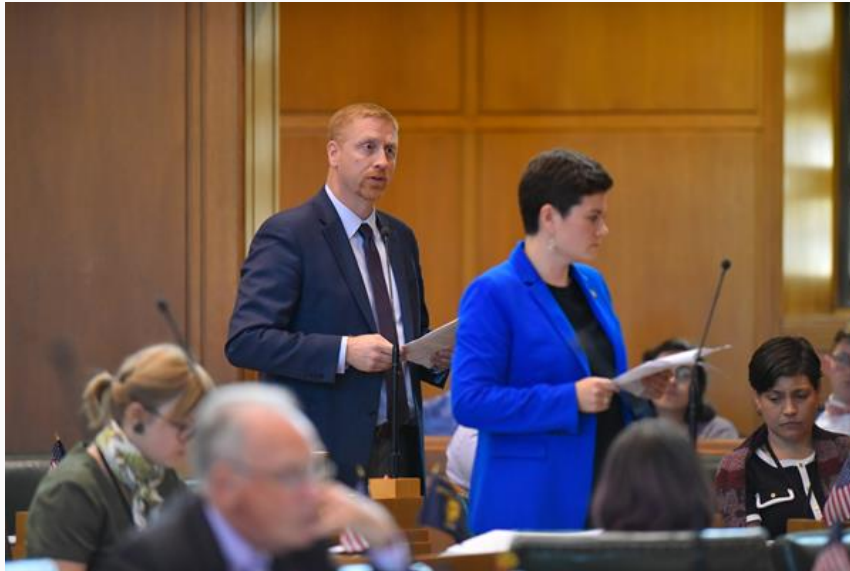
The floor debate on HB 2020

Timber Unite's day at the Capitol. I am still in awe at the passion and participation from that day.